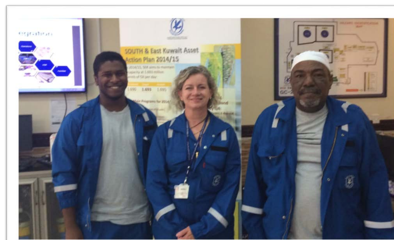
In one of the Gathering Centers of KOC, Kuwait Oil Company, spreading Strategic Goals of 2016/17