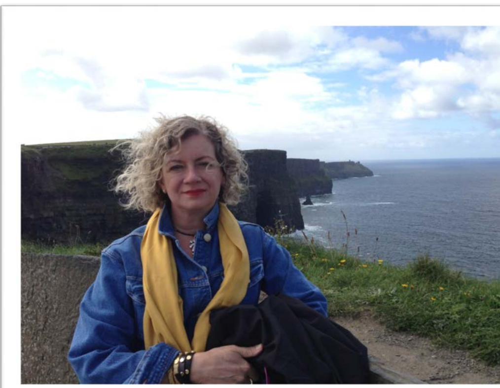
On holiday in Ireland, just look at that strata!