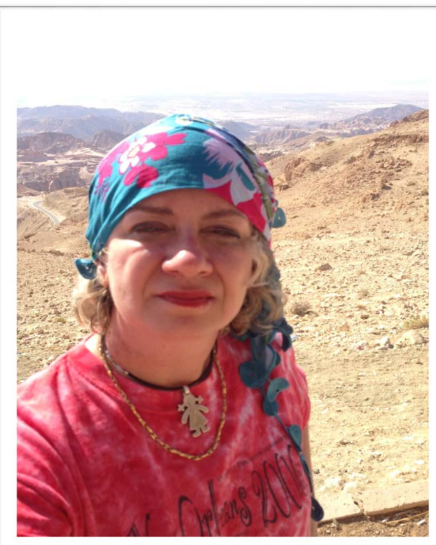
In Jordan, on a field trip to analyze source and seal rocks of the Middle East