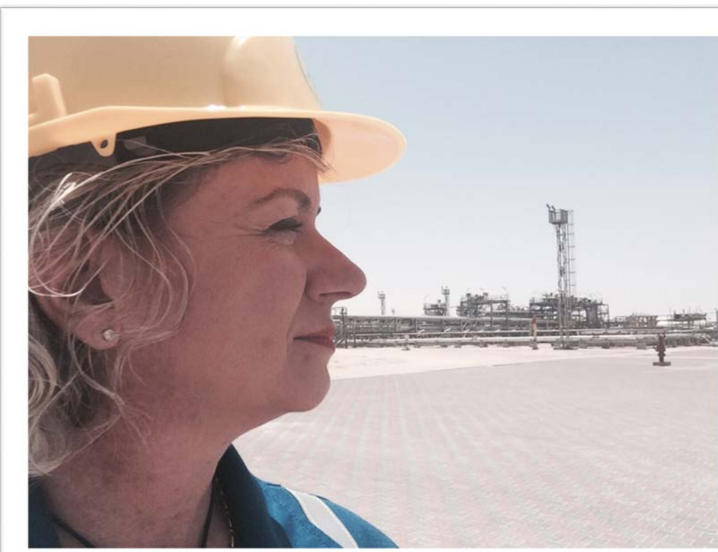
At the Burgan Field, a producer of 3,000,000 barrels of oil per day