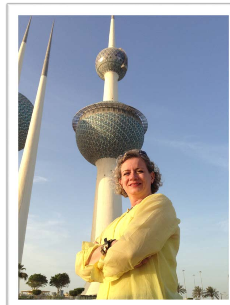
Kuwait towers, the landmark of the State of Kuwait, located in Kuwait City