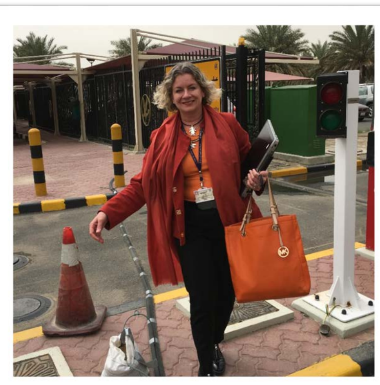
Geophysics is everywhere, even at the office!