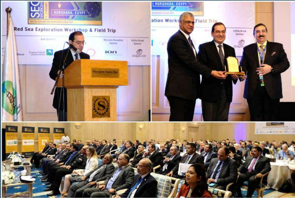
H.E. Eng. Tarek El Molla, Minister of Petroleum and Mineral Resources giving the Opening Address