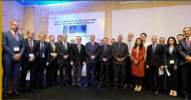
H.E. Eng. Tarek El Molla, with the Technical and Organizing Committee of the Workshop